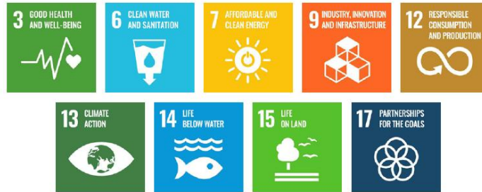
Relevant SDGs for GreenPort Framework

Our GreenPort Framework is delivering measurable contributions to environmental sustainability while supporting relevant UN Sustainable Development Goals. Each strategic themes in our Framework includes commentary on relevant SDGs – with the priority SDGs identified as: