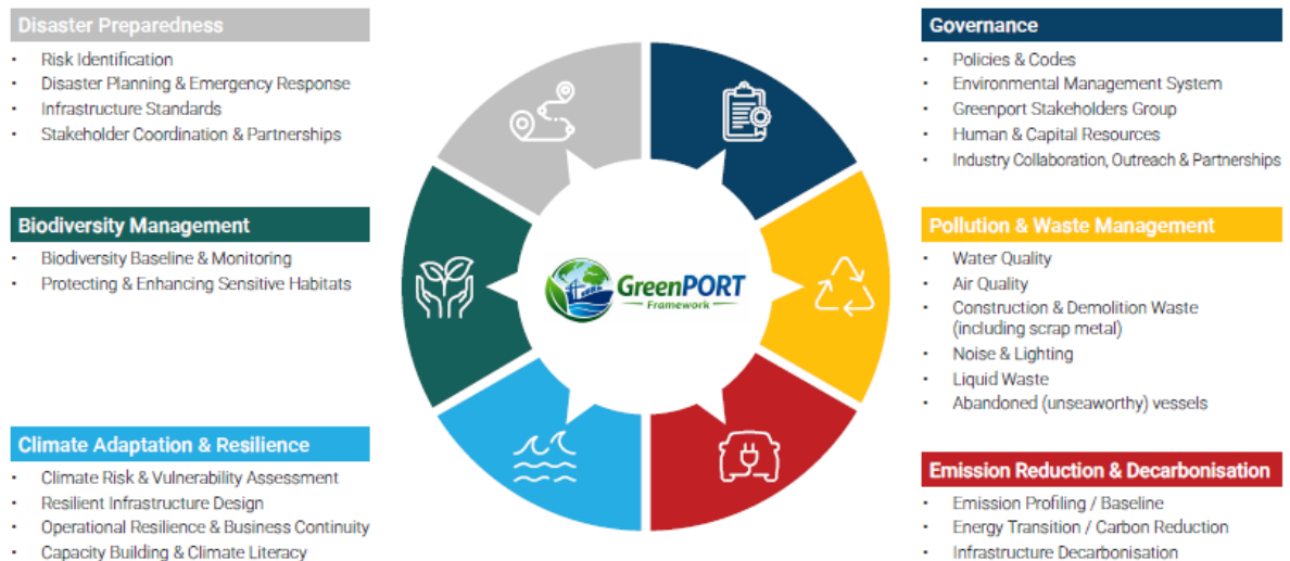
GreenPORT Framework with six (6) key themes and focus areas

In terms of originality – this is the first integrated GreenPort Framework in the Pacific region – and we are determined to lead change.