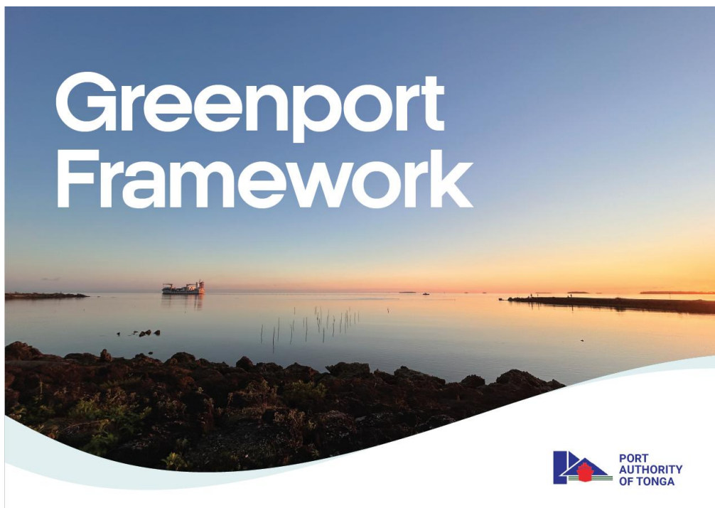
Cover of GreenPort Framework

Overall, we have developed a well-articulated and credible model that clearly communicates our objectives, progress, and long-term vision for sustainable port operations.