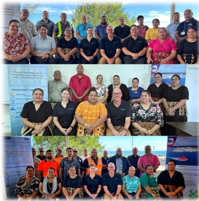
GreenPort Framework Stakeholder Group

By embedding stakeholder engagement into our governance structures, we are strengthening operational alignment, building trust, and ensuring that long-term sustainability outcomes are achieved through coordinated action across the broader port ecosystem.