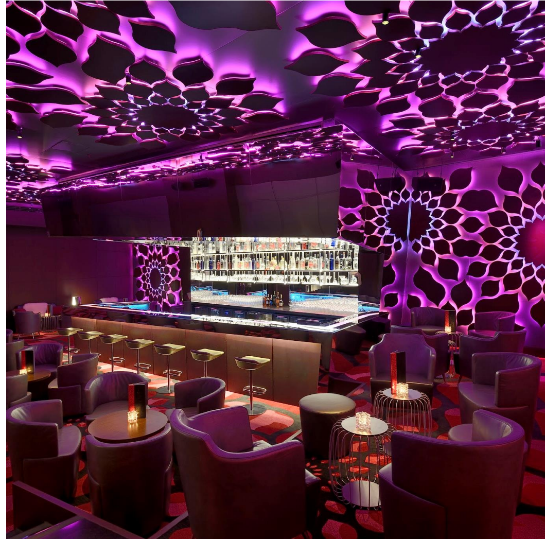
JW Marriot Razzmatazz Bar and Restaurant