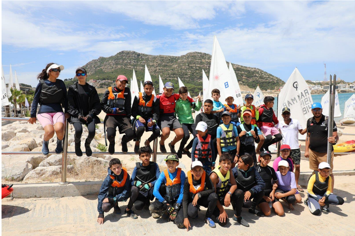
Young sailors and their instructors on the beach.

"Environmental education is not an add-on at Dalia School: children learn to protect the sea in the same place, and at the same time, as they learn to sail it."