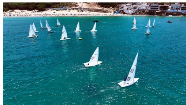
The fleet racing off the Dalia coastline.