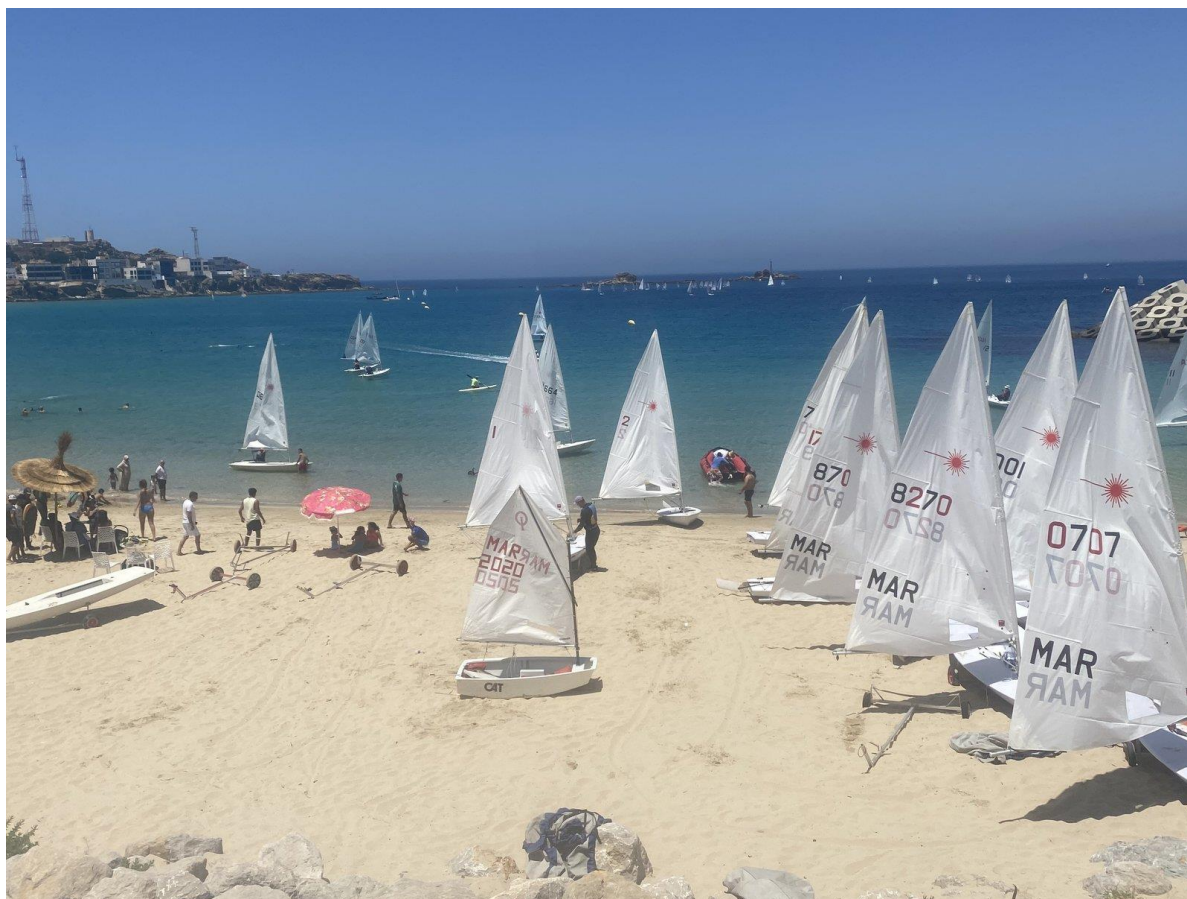
The Dalia Sailing School training fleet on the beach beside Tanger Med Port Complex.

What happened next exceeded every expectation. Within three years, children who had never touched a sailboat were standing on national and international podiums. Within four, they were African champions representing Morocco on the international stage.