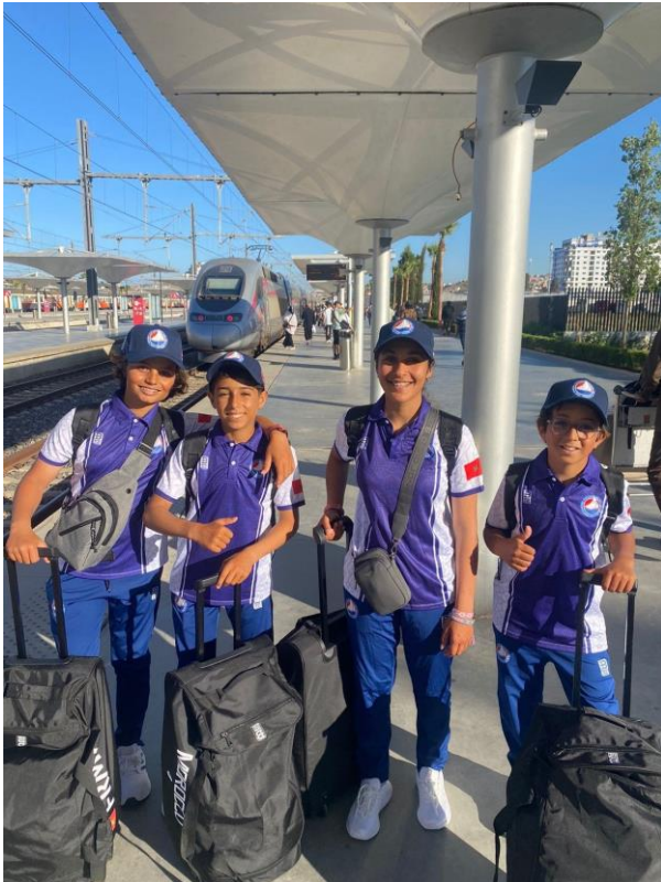
Dalia's young sailors set off to represent Morocco.

Dalia Sailing School demonstrates that high-impact initiatives are first and foremost driven by vision, strong local roots, and human commitment — transforming local resources into lasting opportunities for future generations.