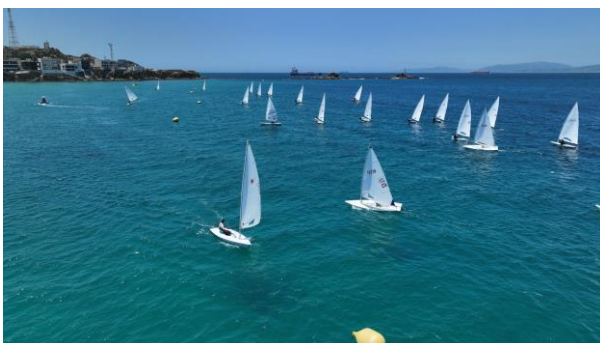
Regatta day in the Strait.