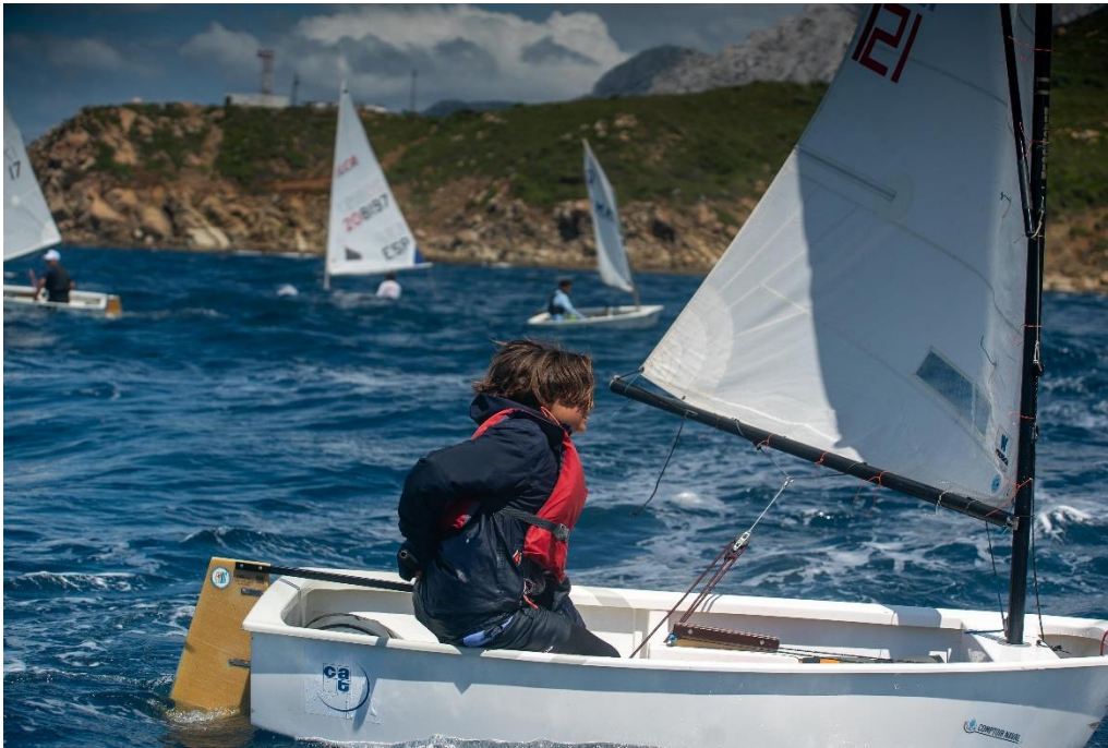
A Tanger Med sail on the waters of the Strait of Gibraltar.

Where the Port Opens the Sea to Children