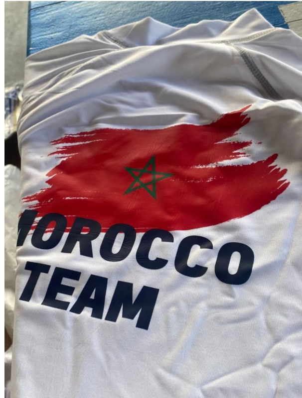
The Morocco team jersey.