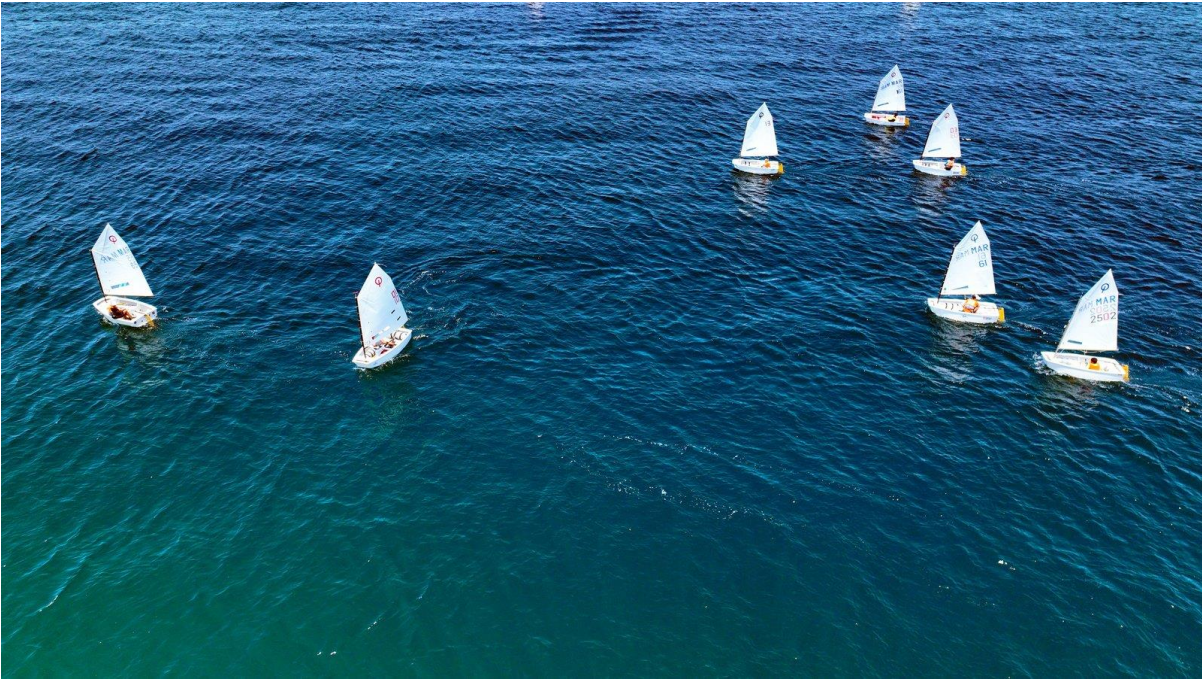
Young Moroccan sailors training in Optimist dinghies off Dalia Sailing School.

Growth tells the story of demand: from 606 cumulative students at the end of 2024 to 797 by the end of 2025 — a 31% increase in a single year. The 41% female participation rate is remarkable in a rural context and demonstrates that the school has become a genuine vehicle for gender inclusion in sport.