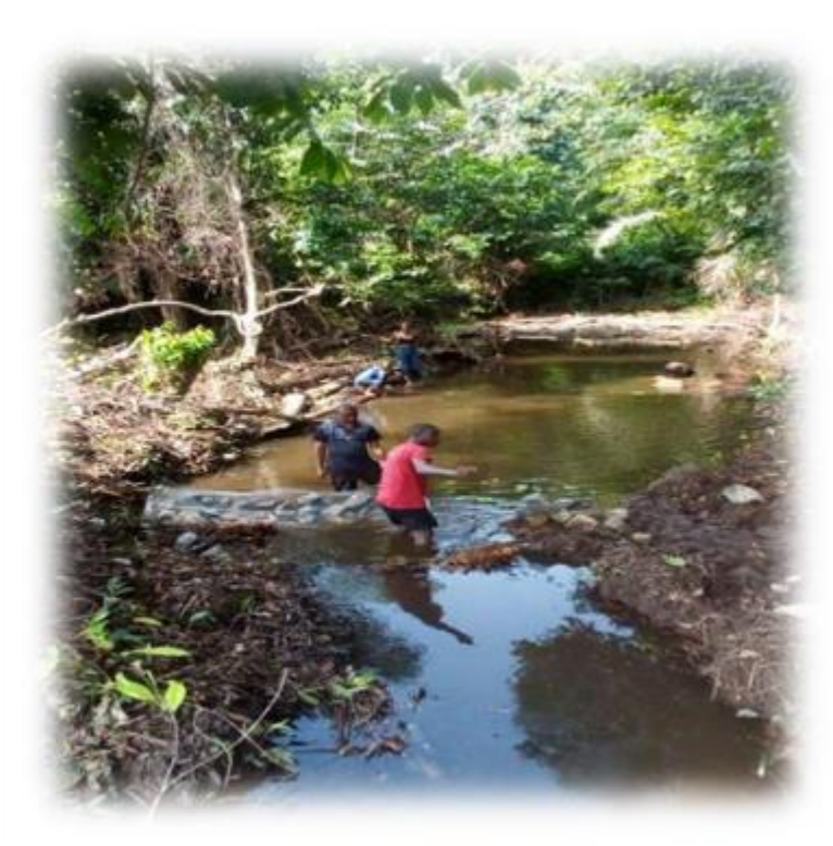
Establishment of aquaculture units in some villages in Kribi