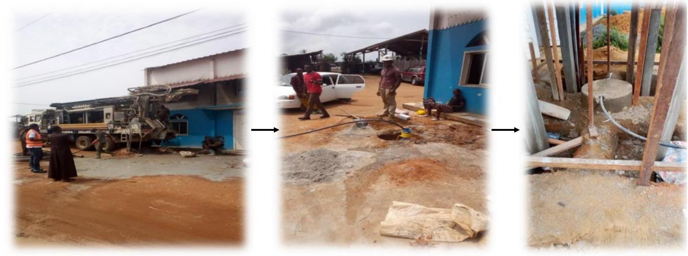
Construction of the borehole in the Newton Saint Thérèse parish