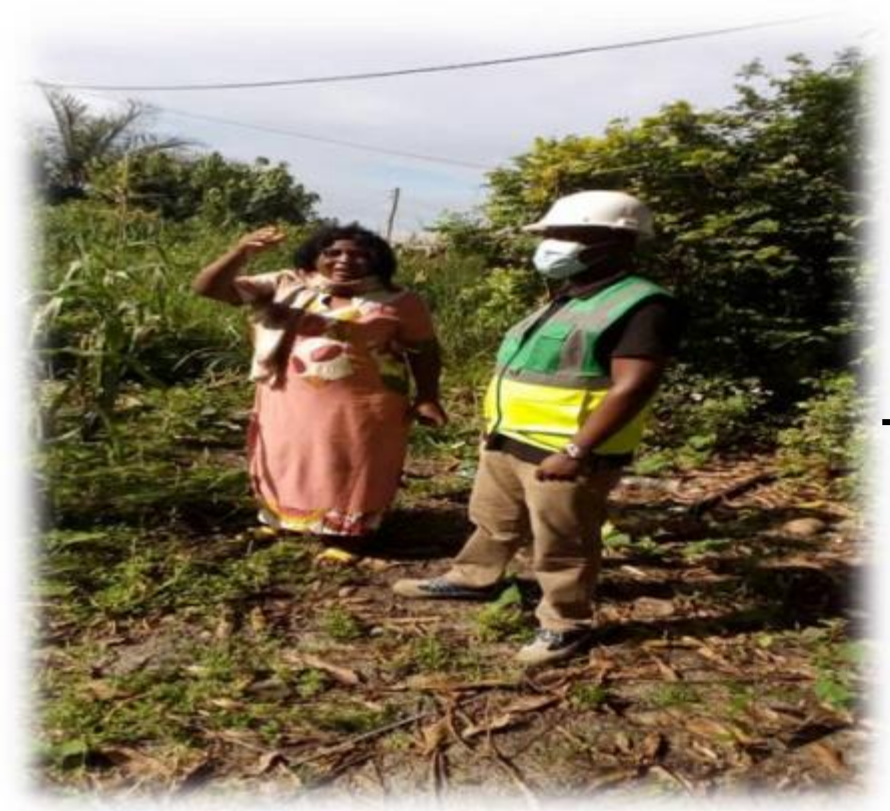
Terrain of the Londji kindergarten school where classrooms are to be built