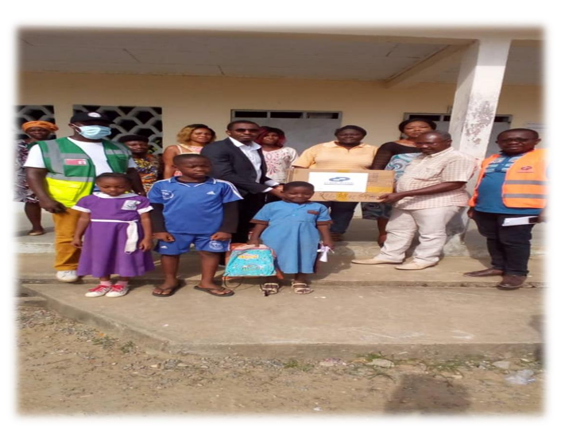
School donations together with one actor of the port community (CIMPOR)