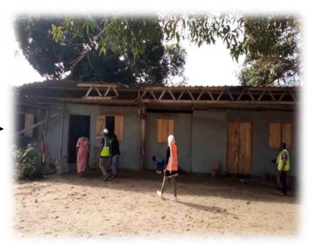
Two classrooms built already on the chosen site shown beside