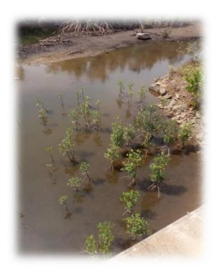
Reforestation of the coastal strip in the locality of Eboundja