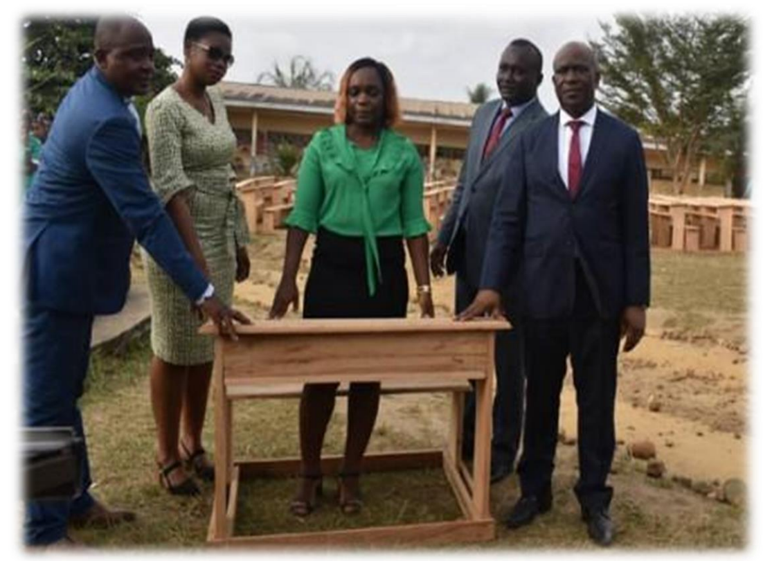
The Port Authority of Kribi promotes education, through a donation of 500 tables-benches to a school in Kribi