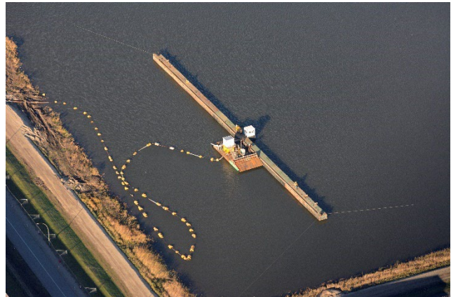
Fig. 2: Spray rinsing of sand (Ponton and aerial image)