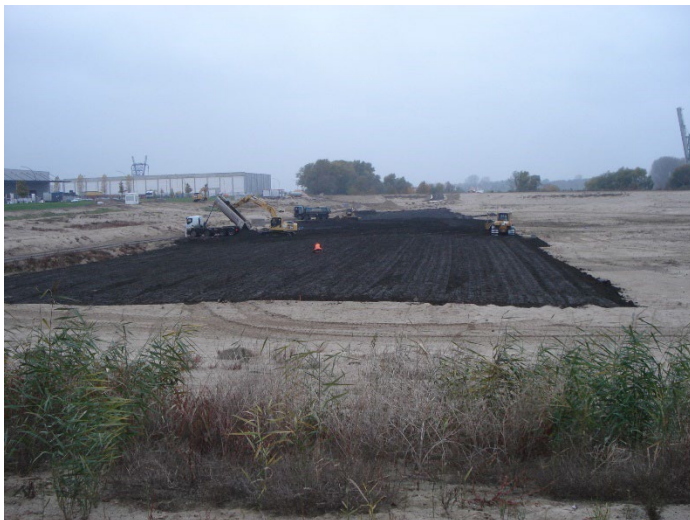
Fig. 3: Backfilling with METHA-material