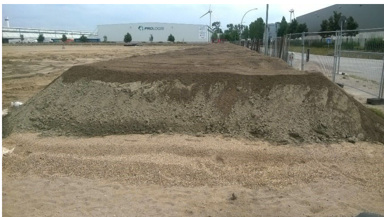
Fig. 4: Build-up of the methane oxidation window