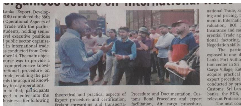
News Paper articles about the visits