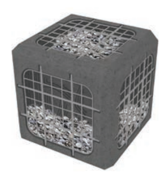
Oyster Shell: Marine proof mesh with pre-seeded oyster shell