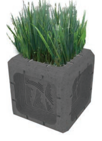
Tidal Planter: Gravel and soil filled for growth of intertidal vegetation

ECOncrete® armoring units were selected as the key constructive elements in a large scale federally funded project that won the rebuild by design competition. The project called "Living Breakwaters" proposed by SCAPE Team, is now undergoing detailed design.