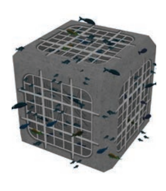
Fish Hubs: Marine proof mesh for providing protected fish

dispersed in-between rock armor, or left as stand-alone units (e.g., as an anchoring unit).