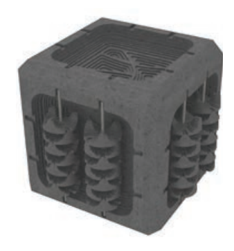
Oyster Hatchery Unit: Concrete disks pre-seeded with oyster spat