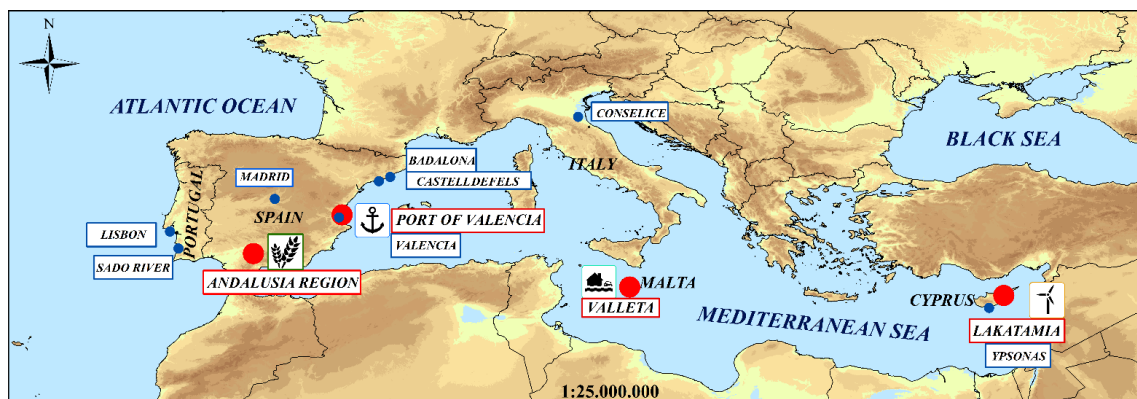
Figure 1. Geographical distribution of the four CRISI-ADAPT II demonstrations and nine receiving regions.