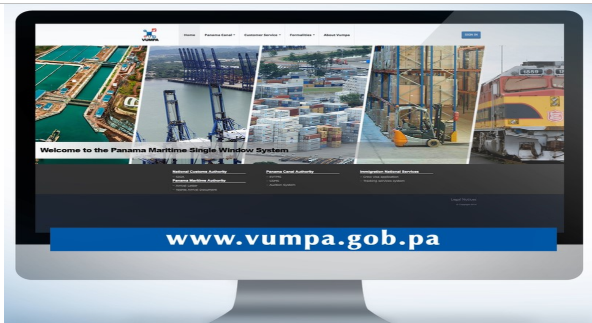
VIEW OF MARITIME SINGLE WINDOW OF PANAMA

At this moment we are, in phase 1B, of the implementation of the Panama Maritime Single Window System, which covers all the ports of the Bay of Manzanillo (CCT, COASA, MIT), Colón 2000, Home Port, Decal, Melones , Playita de Amador Resort and Marina and Amador and Resort Marina, which represents about 87% of the international trade ships that go up to the waters of the Republic of Panama. This phase also includes the recent implementation of the electronic departure authorization.