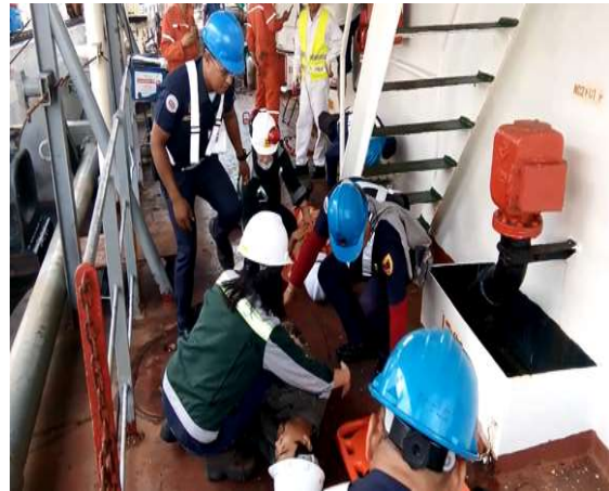
First aiders providing triage and immediate treatment to the victims