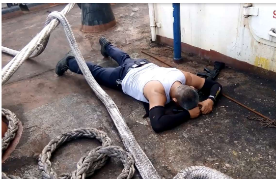
The mock gunman lied motionless outside the weather station room