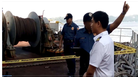
Police Officers cordon the area to secure the crime scene while discussing to the vessel captain what really transpired to the incident