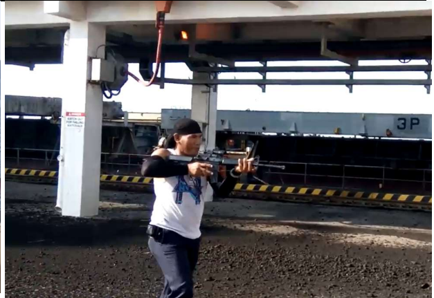
The attacker firing his automatic rifle indiscriminately at the Jetty area