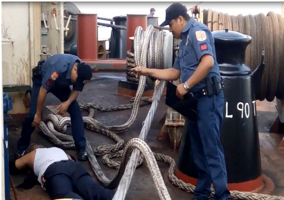
Police Officers conducting investigation at the crime scene