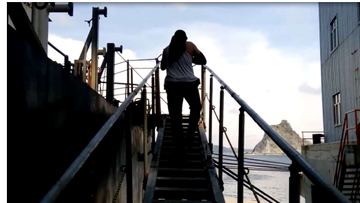
The gunman while boarding the MV Glory Vessel