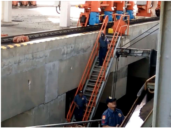
Police Officers while entering MV Glory Vessel and begin a sweep for the suspect