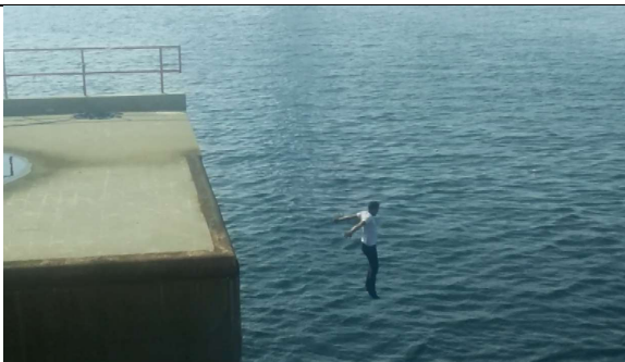
Mock volunteer fleeing managed to jump off to the ocean to evade the attacker