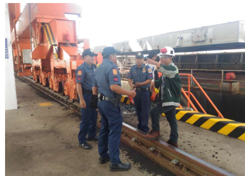
Arrival of the first responding Police Officer asking for further details about the incident and assailant location